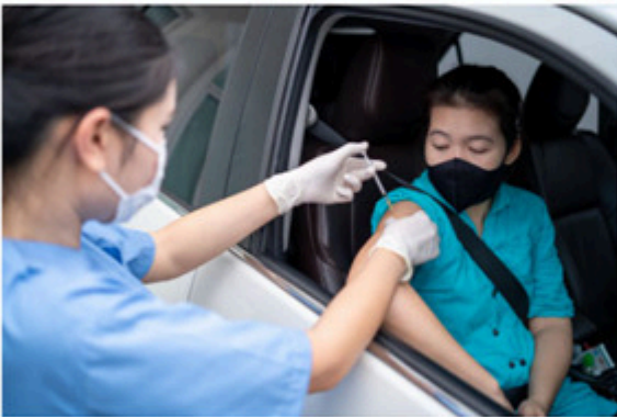
Drive-thru vaccination stations have proved popular elsewhere